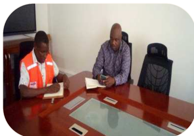
Right: Safe Way Right Way Sociologist meeting Petroleum Authority Uganda official