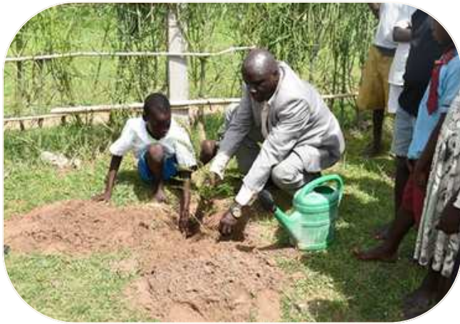
The DCDO planting a tree at Kisansya Primary School Kisansya PS