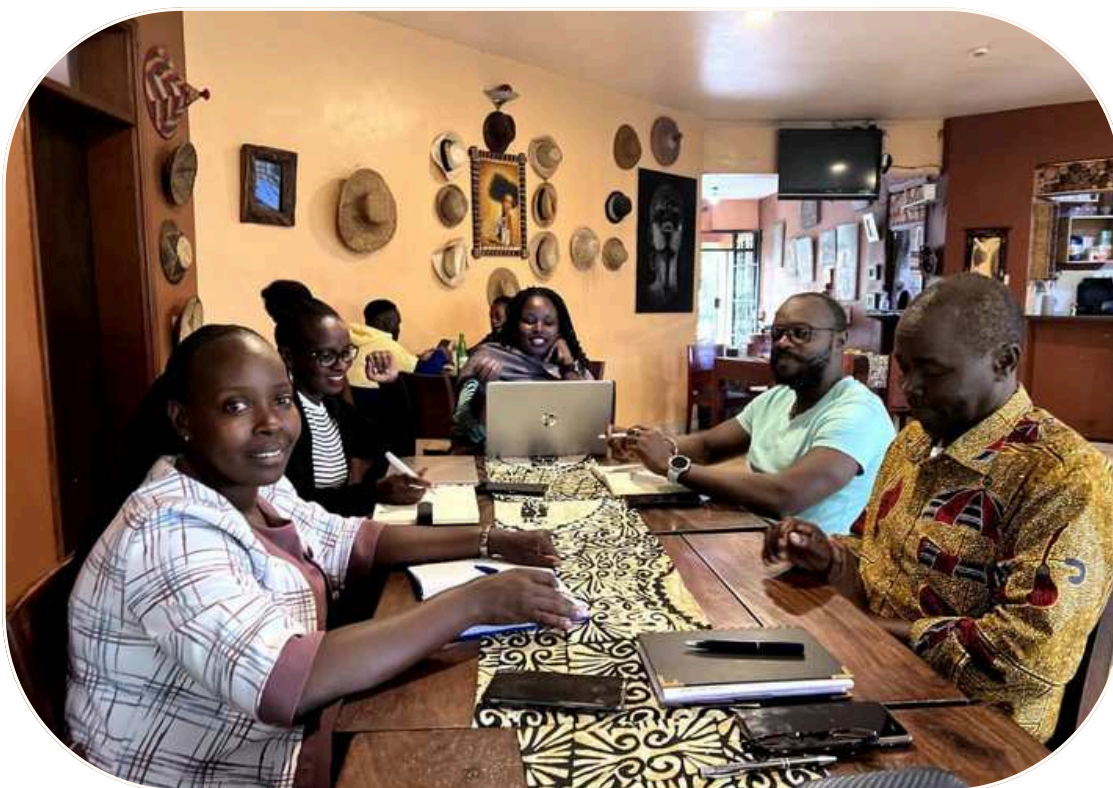
Safe Way Right Way and total Energies Uganda staff meeting with Kabojja Junior School VIA trainers initiating them into the VIA ambassador competitions.

TotalEnergies Foundation trained SWRW staff to empower them to deliver on the program. 4 SWRW staff were trained and oriented on the annual VIA creativity competition and the trained staff trained the teachers of the selected schools from the 5 selected schools. The training was conducted online. The project requires constant supervision by the staff and the program is expected to end in November 2024.