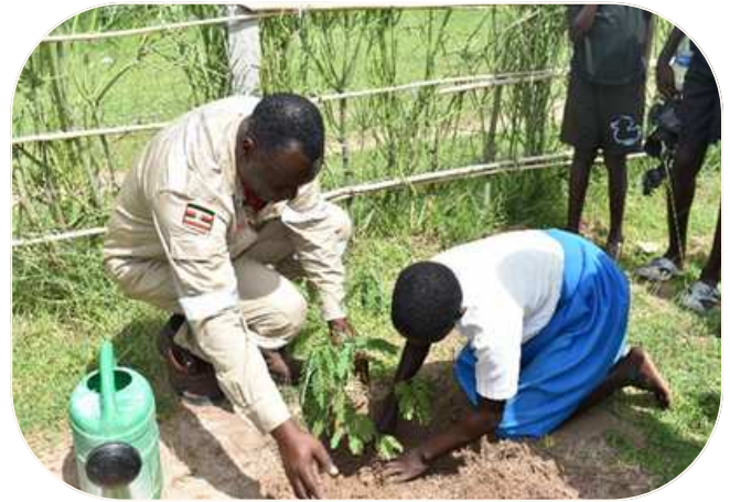
Total staff supporting tree planting at Kisansya PS