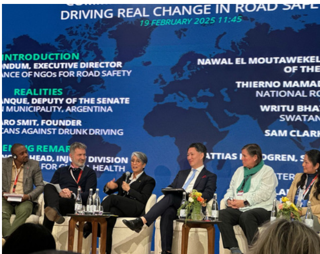
Panelists discussing the topic 'Driving change in road safety' at the conference

There emerged a purposeful debate on the need for clear leadership for road safety in Government bodies, agencies, Non Government Organisations, Academia, private entities and all other stakeholders. This would overwhelmingly lead to the realisation of the goals set by the several countries.