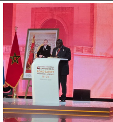
Minister Katumba making commitments on behalf of Uganda

20, 2025, was attended by honorable ministers, delegates from several countries, civil society officers, and individuals with a specialty and keen interest in road safety.