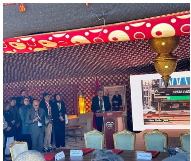
Opening ceremony of motorcycle safety at the road safety village at Marrakesh