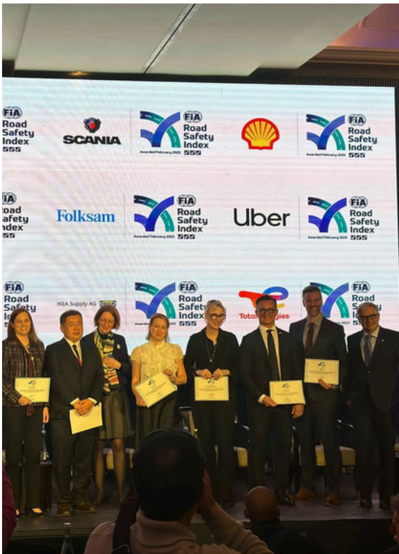
TotalEnergies, and several companies were awarded for promoting road safety

Themed "Commit to Life," the event was purposed to assess the progress made in implementing the Global Plan 2021-2030 during its first five-year period. It also aimed to generate support for the new vision of safe and sustainable mobility.