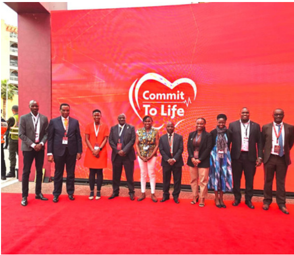
Uganda Delegation pose for some photos at the conference in Marrakech

The Uganda delegation, led by the Honorable Minister of Transport and Works, Gen. Katumba Wamala, attended the conference. Irene Namuyiga updated the Minister on Safe Way Right Way's efforts toward standardising helmets for Ugandan riders and the advocacy efforts to engrave those standards into legal regulations.