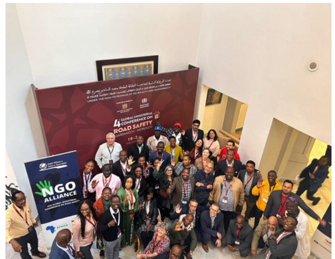
Photo moment by the participants of the African chapter at the Global alliance of NGOs in Road safety symposium